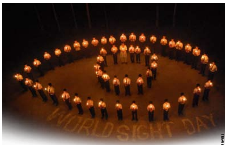
Children in India holding a candle rally on the eve of World Sight Day