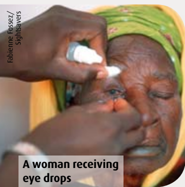
A woman receiving eye drops

Such a production unit is traditionally not a profit making enterprise but, if it is well managed, the LPED unit has the potential to make money for the Kenya Society for the Blind, to fund other eye care activities such as rehabilitation and cataract surgery.