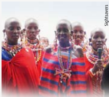
Masai elders help convince the public that Zithromax is perfectly safe

Government, NGOs and faith groups were involved in rolling out the treatment over the next month – a great step forward in preventing trachoma which accounts for 19 per cent of total blindness in Kenya.